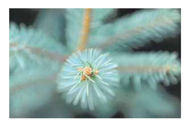
ABOVE: Blue spruce needles are spread evenly around the stem — a tell-tale identi-

LEFT: Rachel Winters talks about Oregon native Port Orford cedars and their modified leaves.