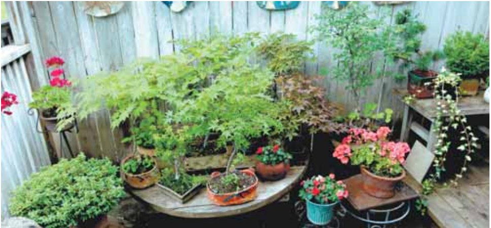
This collection of mostly Japanese maples sits underneath a series of ceramic plates that Winters made depicting different trees she has seen.